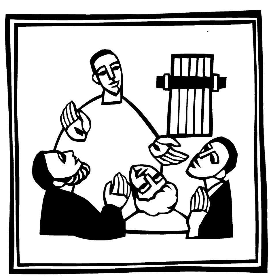
2<sup>nd</sup> Sunday of Easter April 11<sup>th</sup>, 2021 9:00am

THAT ALL MAY KNOW THE LOVE OF GOD IN JESUS CHRIST