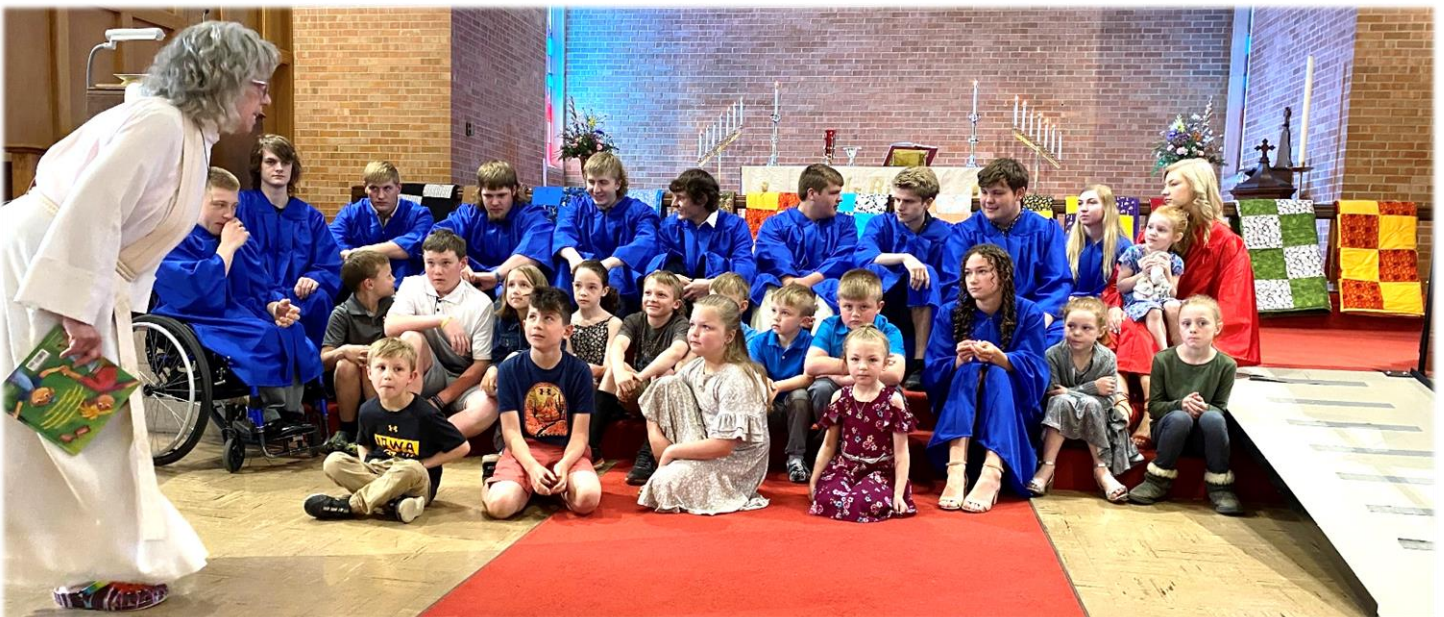
Sitting for the Children's Sermon