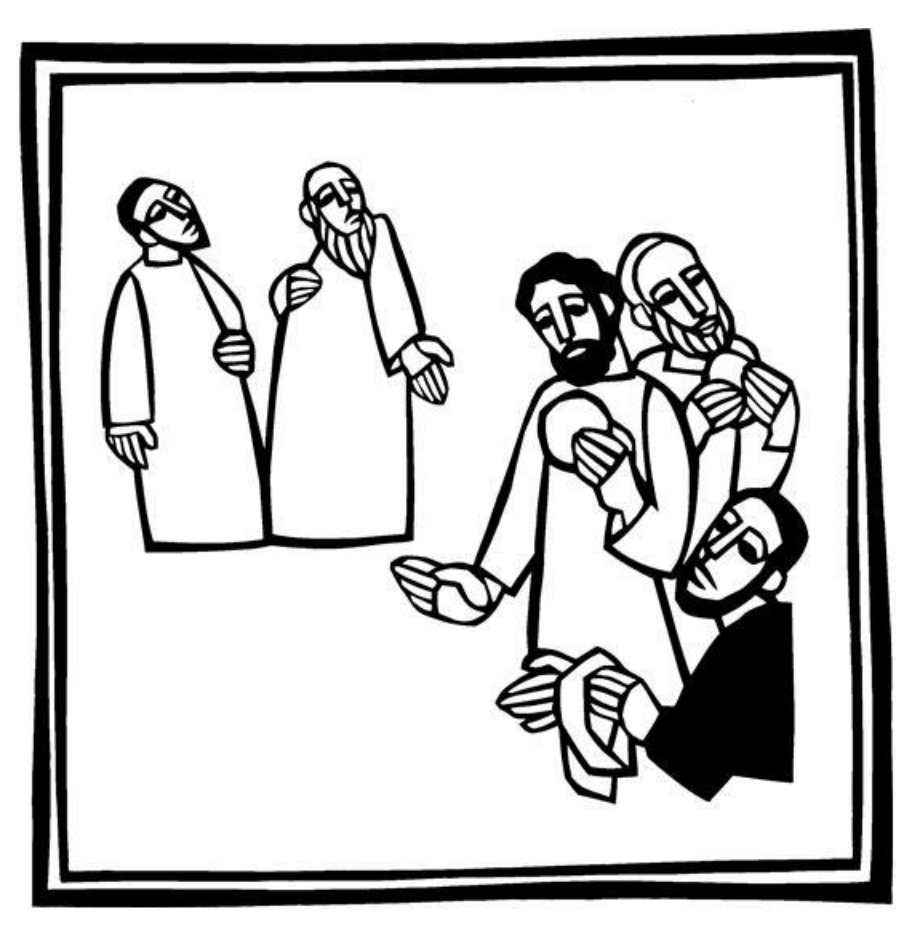
14<sup>th</sup> Sunday after Pentecost August 29<sup>th</sup>, 2021 9:00am

THAT ALL MAY KNOW THE LOVE OF GOD IN JESUS CHRIST