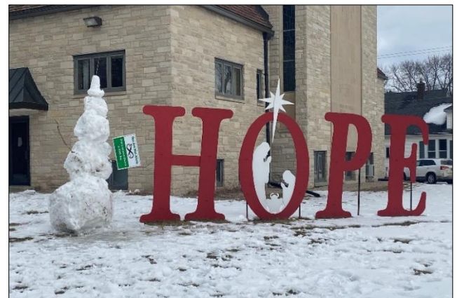
The Senior High Youth Group were able to get out and make a snowman late in January

As of right now, Lifest festival in Oshkosh, WI. Is still going on as planned for July. We currently have around 35 students signed up to go this summer, and if any plans needs to be changed I will let people know here in the Focus as well as online.