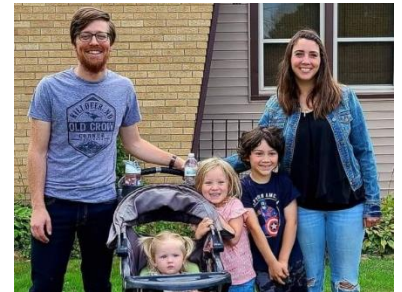
Community Church of Hokah PO Box 111, Hokah, MN 55941 507 894-4466