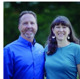
Village Missions PO Box 197 Dallas, OR 97338 503 623-4107