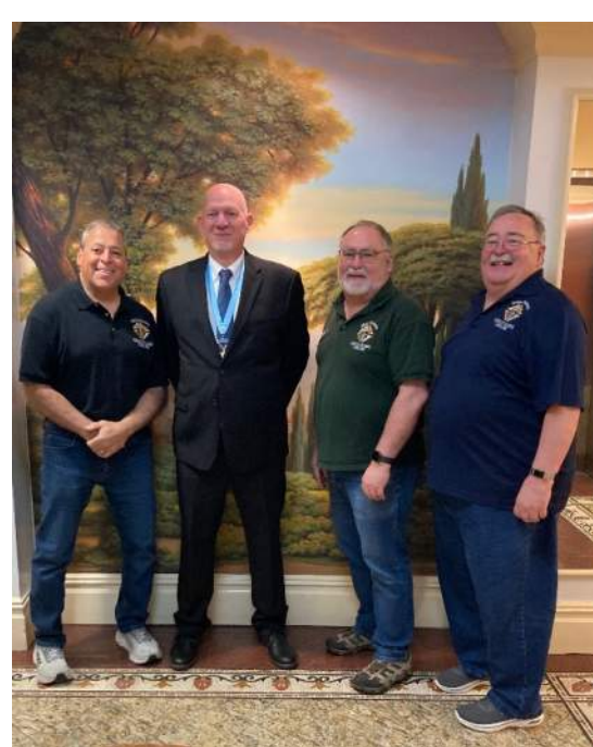
...Photo below is at the State Convention 2024