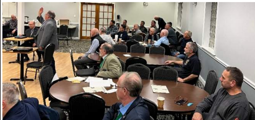
Photo above, scenes from our meetings; thankfully, healthy attendance (as usual)