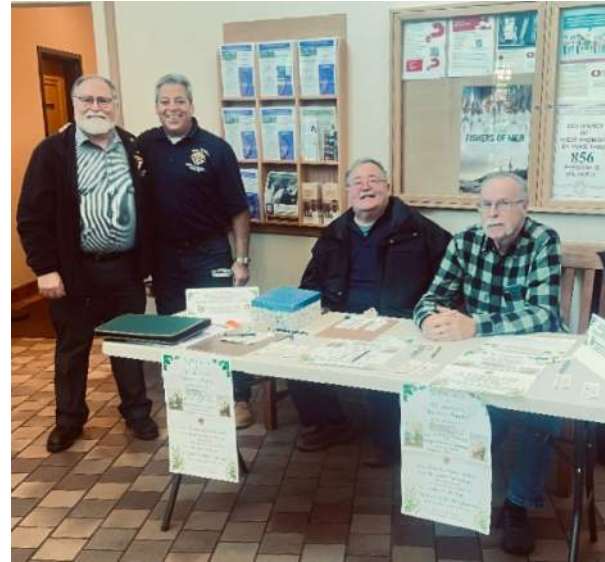
Photo above- thanks to all who helped out with selling Pot of Gold raffle tickets and membership at St. James. Plea to all membership to participate in these endeavors.