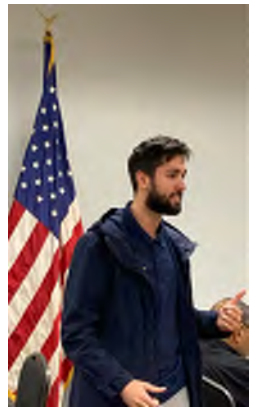
Photos this page- Delaney Council Annual Light Up For Christ- Children's Christmas Party