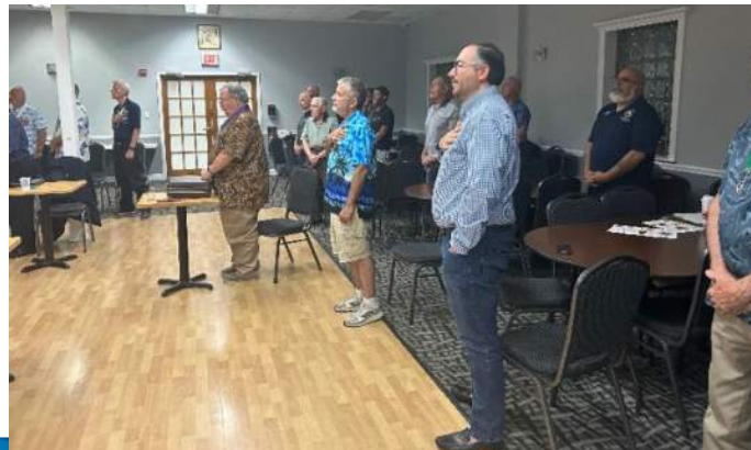
Photo at left- Brother Knights pledging allegiance to the flag of our great country.