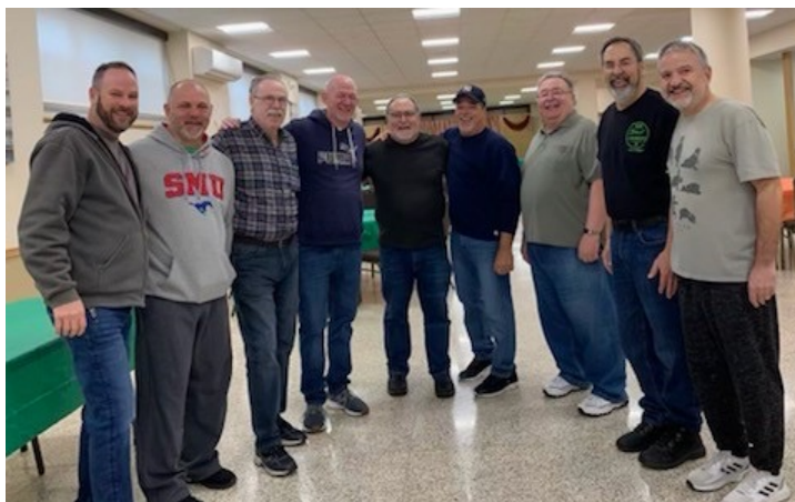
Photo below- setup crew for the party...