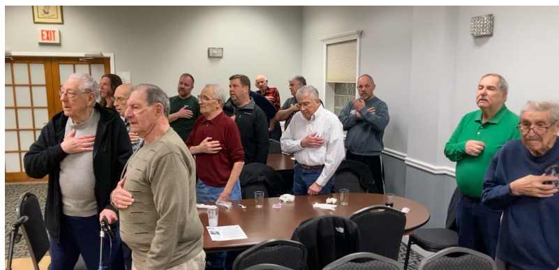
Photo right Brother Knights salute the flag and recite the Pledge of Allegiance to the United states of America