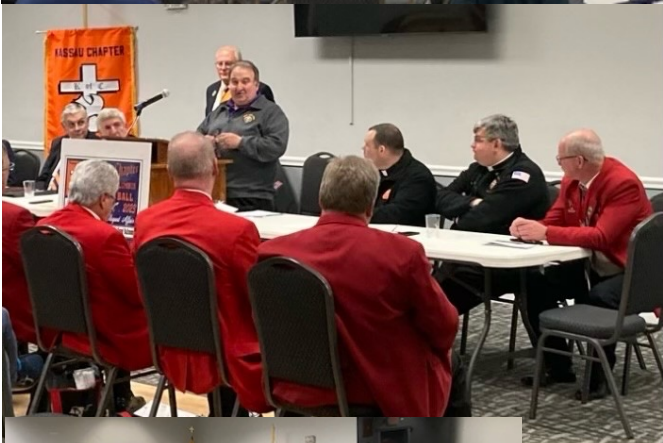
Photo at left, we were honored by the presence of our State Deputy, Deacon ....Photo below, Squire of the year winner ....