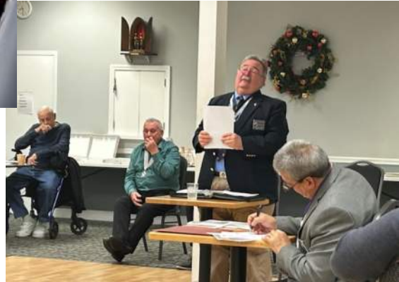
Photo below- The 300 Club Committee draws numbers at the February meeting