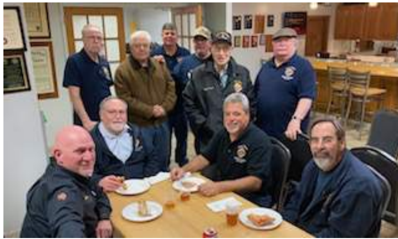
Delaney Council once again hosted the fourth degree assembly Meeting, Feb. 2023 (photos below and at right)