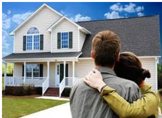
Protecting homeowners from costly exposures

Germania Mutual Insurance Co. is excited to introduce an affordable alternative to costly product and home warranty plans. Canadian homes keep getting bigger and they are becoming better equipped. Home System Protection provides coverage on a direct physical damage to “covered equipment” caused by a sudden and accidental mechanical or electrical breakdown.