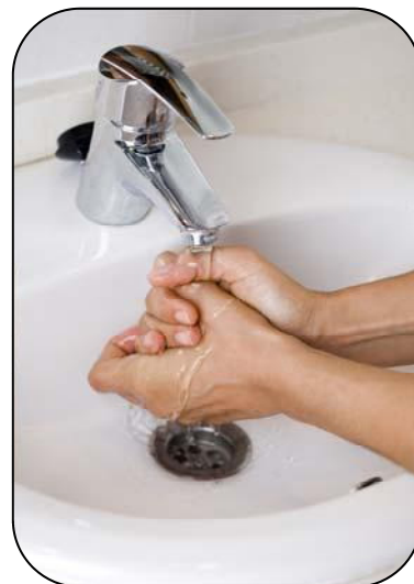
Gloves are great, but wearing them does not take the place of washing your hands!