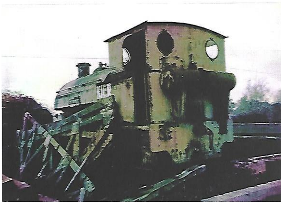
Two pictures of Kiers Loco, although taken at Setch, it was for use on Kier sites and had nothing to do with the Oilfields operation.