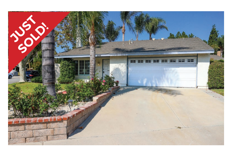
2086 Shady Brook, Thousand Oaks 2 Bed + 2 Bath • SOLD $639,000 ($546/per sq ft)