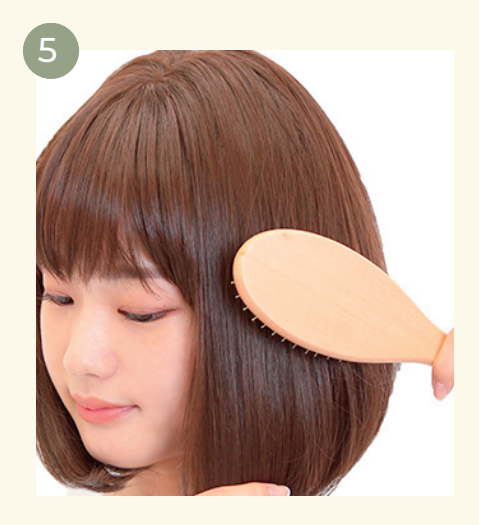
Gently brush and style the wig starting from the ends of the hair.