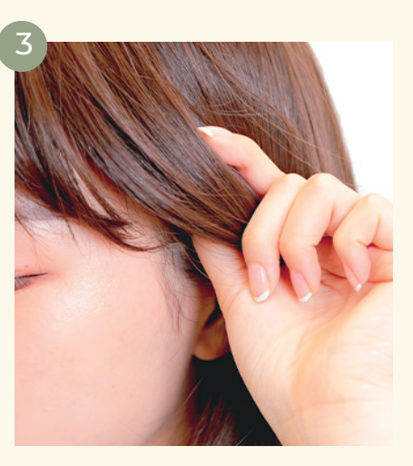
Hold the temple areas with both hands and adjust the position. Lightly bend the temple wires inward to align with your face line.