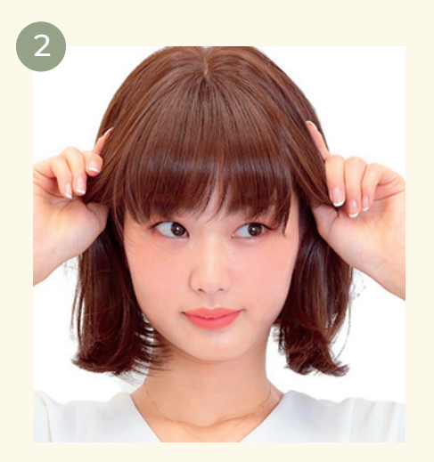
Align the wig properly and put it on from the front. While holding it in place to prevent shifting, tuck the back of the wig into position.