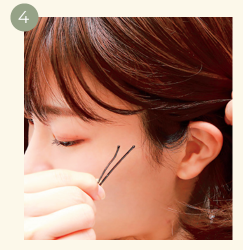
To achieve greater stability, you can use pins to secure your natural hair, wig net, and wig in place.