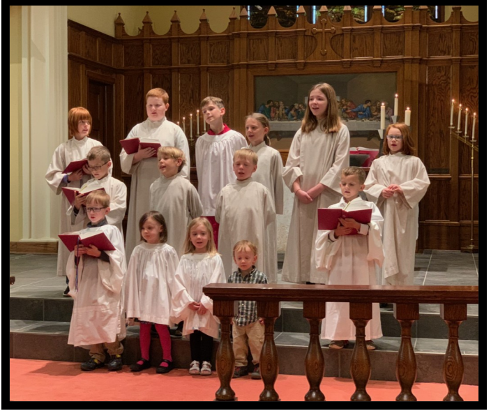
The Sunday School children sang with the choir on May 12th

Children's weekly Sunday School takes a break over the summer months but we are planning to gather as a group on a few Sundays over the summer. Parents will be notified soon, by email, of the upcoming summer schedule.