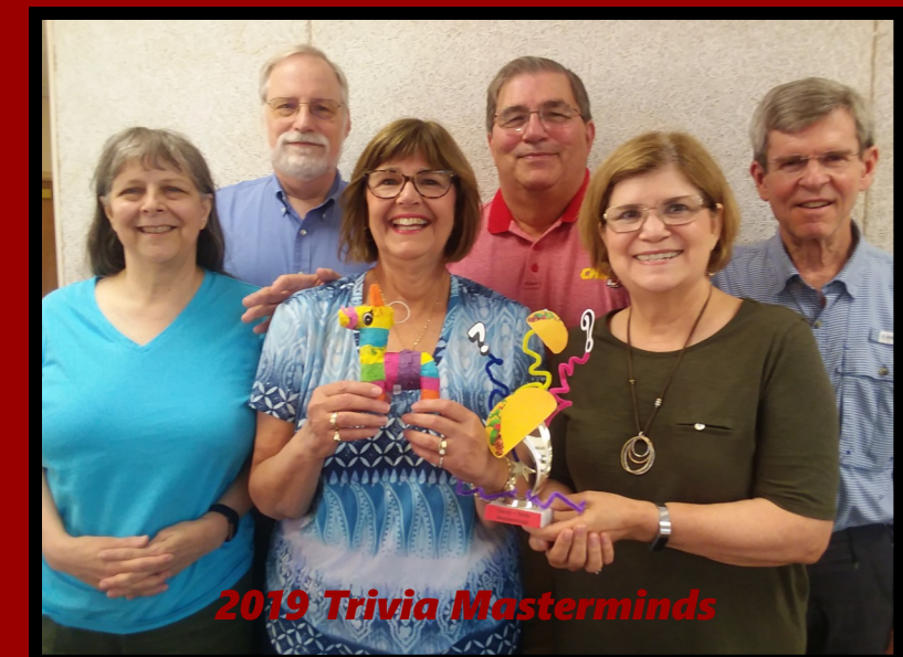
2019 Trivia Masterminds