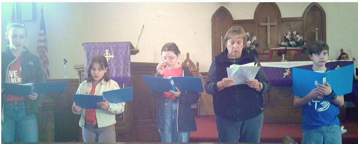
Confirmation class proclaiming the Word at Gathering Table

We will have a soup lunch! Many thanks for donating soup for the first two Lent services. They were so yummy! We will serve the left-overs at the next WELCA meeting.