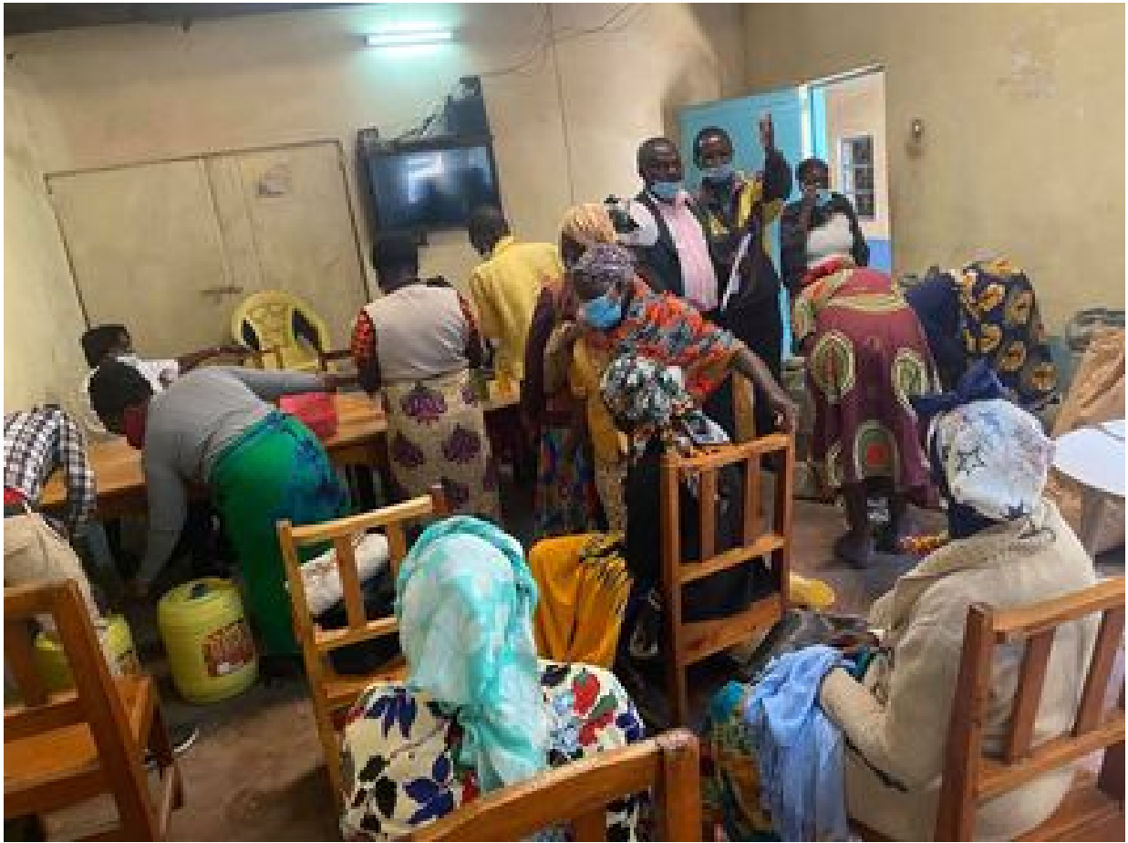
Guardians of children who are assisted by the KCF gather once a month to receive food donations that help them stave off hunger.