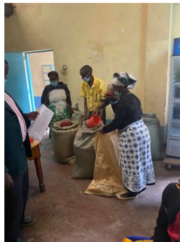
Grains and cereals are among food staples that the KCF team in Masii, Kenya, distributes each month.