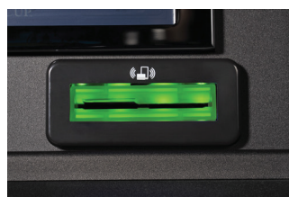
Green indicates active "carded"