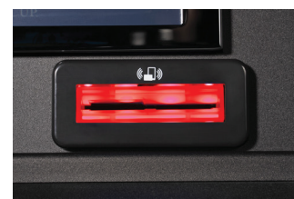
Red indicates misread/failed connection

Technical Requirements: Available with Synk Box 2 and SYNKROS version 3.24.9 and higher. Contact your Konami Account Executive today for further information.