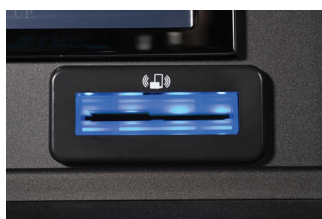
Blue indicates "uncarded"

Konami's RGB Card Reader features internally lit RGB functionality that emits changing light colors to signal the status of player login at a machine. The color changes to blue for an inactive/uncarded connection, green for a successful active connection, and red for a misread/failed connection. This provides immediate visual communication to players and staff on login status. It can even combine with Near Field Communication (NFC) technology for contactless login authentication. The RGB Card Reader is also available for purchase apart from SynkConnect.