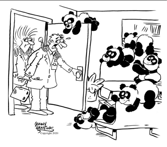
"Oh, no – it's a panda-emic!"