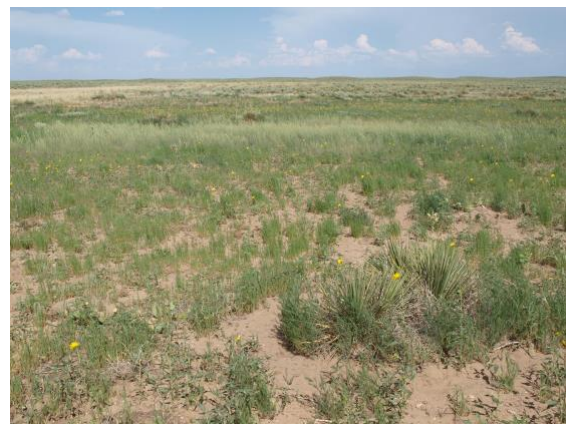
Representative rangeland ecosystem—where restoration practices can drive measurable improvements in resilience and soil health.

within a structured program, this resource can help accelerate recovery of degraded western ecosystems, save potable water for highest and best use, and support measurable improvements in soil health, safety, sustainability, and overall environmental resilience.