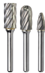
464-00511 3pc 1/4" Shank Aluminum