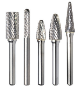
464-00514 5pc 1/4" Shank Double Cut