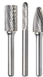
464-00513 3pc 1/4" Shank Double Cut