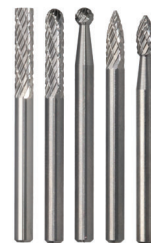
464-00516 5pc 1/8" Shank Double Cut