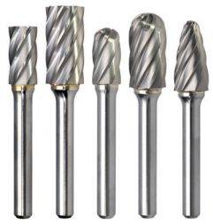
464-00512 5pc 1/4" Shank Aluminum

Contact your local SHAVIV Representative or customer service at VNE Corp. with any questions or to place your order.