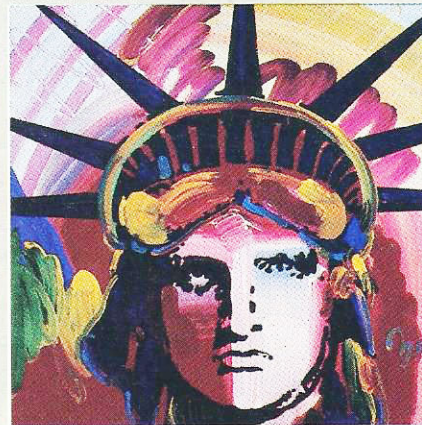
The lady love of Peter Max

in awful shape. He said, if there was anybody who should ignite interest in getting it renovated, it would be me. When he left, I felt this surge of responsibility to this country that I love. So I called Nancy Reagan, because in 1983 I had spent three days at the White House painting Statues of Liberty. I told her that I would like to get the Statue renovated and start an advertising poster promotion called Save The Lady. She thought it was a great idea. The White House doesn't finance anything like the sale of posters or the raising of money. To do