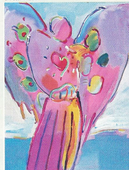
Angel of the Internet