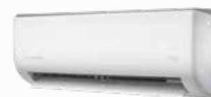
Serene wall hung split