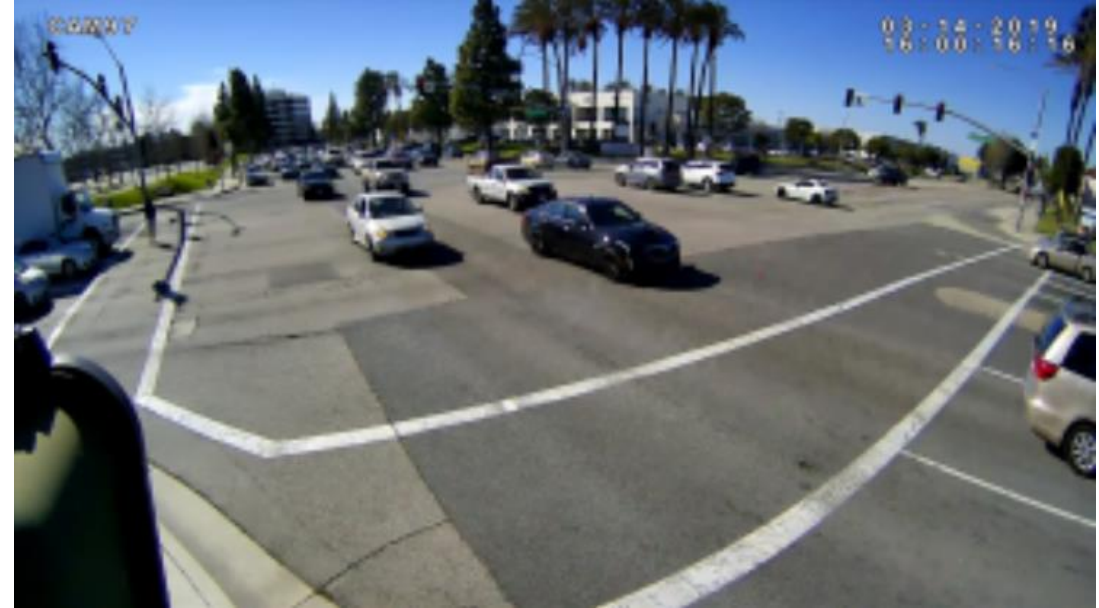
Example of count camera, Counts Unlimited