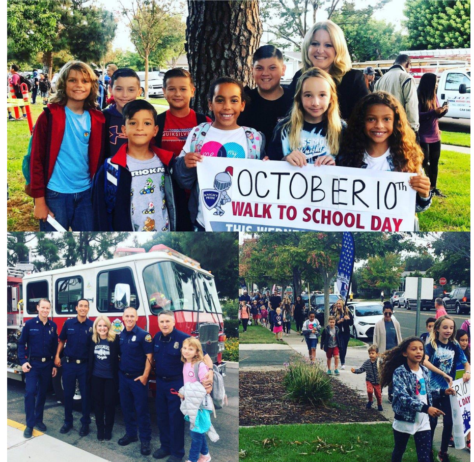
Walk to School Day, Rossmoor Elementary