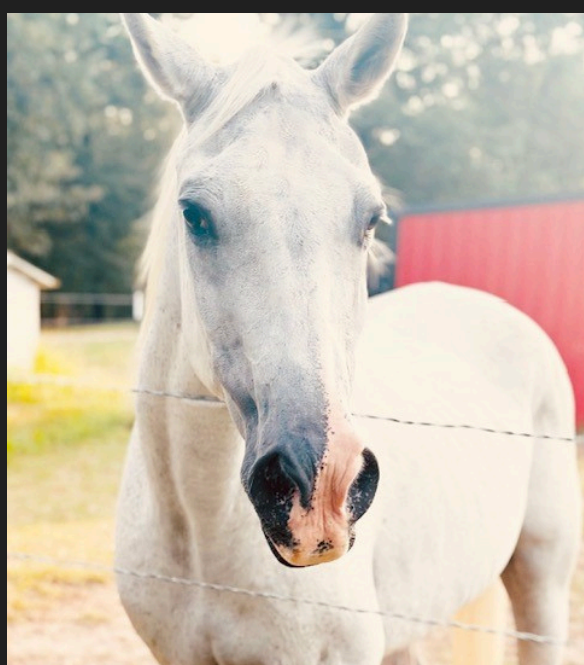
Tag 140, her ribs jutted through dull, patchy fur, her head hung low, her eyes, dull and sunken, told a story of suffering.