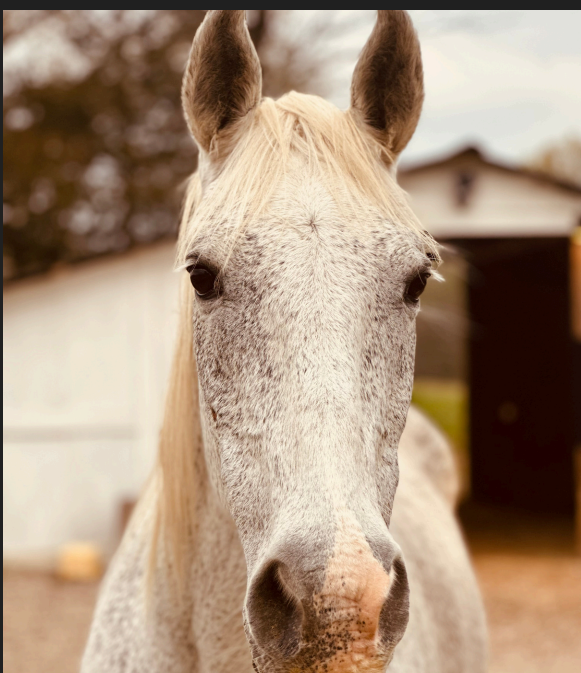
Tag 1522, Goose, joined our herd rescued from the kill pen, bruised, broken and starving.