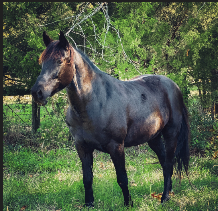
Tag 802 joined Winsome suffering severe arthritis, no longer useful to his owner at only age 8, he entered the slaughter pipeline. We call him Thunder.

In the U.S. 100,000 horses become unwanted every year. Unwanted horses are equine that are no longer useful to their owners due to illness, injury, age, misbehavior, unmarketable qualities, or financial hardship. About one-half of unwanted horses become neglected or discarded often sold at auction entering the slaughter pipeline.