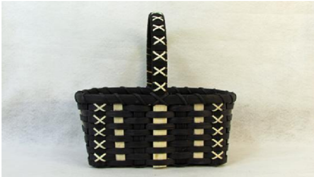
Terina Black and Natural

This dramatic basket features bright white X's on a black background around the basket. The final design accent is a unique black suede handle wrap with matching white X's. This striking small market basket with a solid woven base is both decorative and useful.