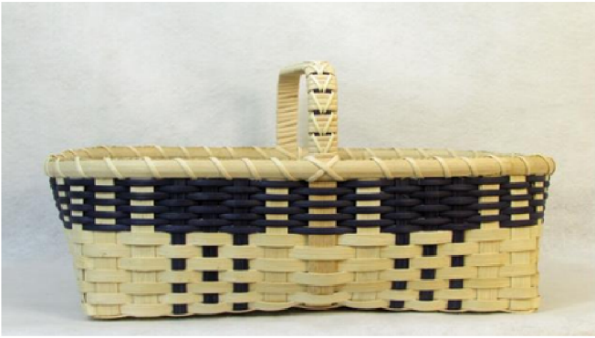
McClintock Color choices available

This big basket is woven using dyed and natural reed for a lovely two-toned effect. The handle is a rectangular hoop, which gives the basket a unique shape. The V-stitch handle wrap is the ideal finishing touch.