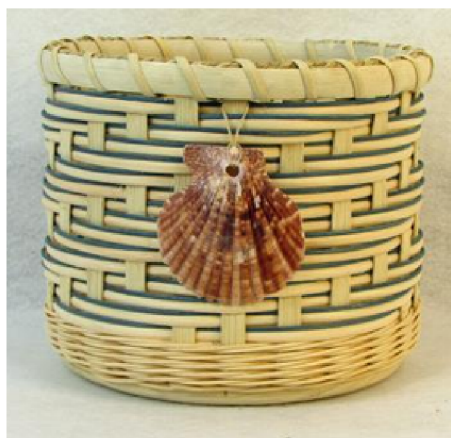
Down By the Sea Color choices available

Make this charming project with a beachy vibe! This basket starts with triple twining and features a continuous twill weave with dyed round reed as an accent. It is woven over a class mold. Tie on a beachy embellishment or leave it off to let the twill shine.