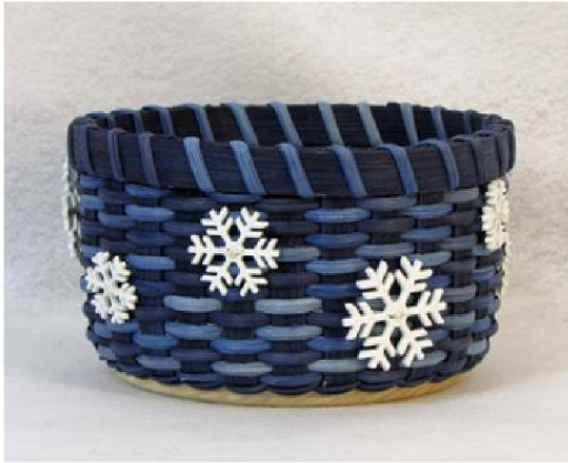
Snowy Treat Blue Space-Dyed

This small wintery basket is a nice size for a gift or to store your own treats. It has a wood base and is woven with blue space-dyed reed. The playful snowflakes add the perfect finishing touch.