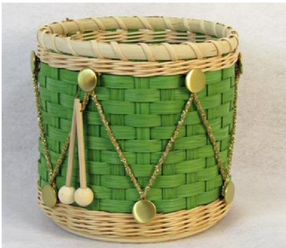
Rum-pa-pum Color choices available

Thanks, your cooperation with these requests helps a lot.