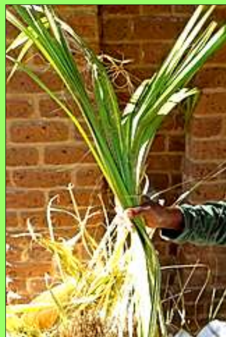
Fronds from a palmetto tree