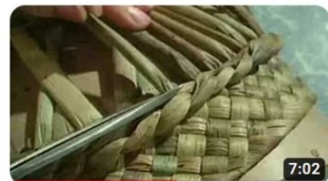
Hands Rushworks Part 3