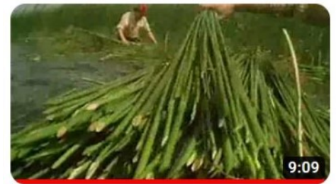
Hands Rushwork Part 1