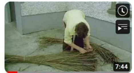
Hands Rushwork Part 2