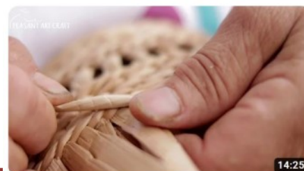
Weaving Cattail Baskets 104K views • 3 years ago