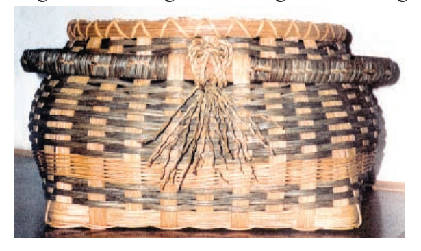
The Great Island Floor Basket by Mary E Skillings and Lynda Cuculich

The hot weather is almost over. Soon we will be stuck inside and have more time for cleaning and weaving. While we must clean, why not make baskets to put items in as you clean up. One of the things I like about weaving is you can make a basket to fit what needs storing. The following baskets are good for storing.