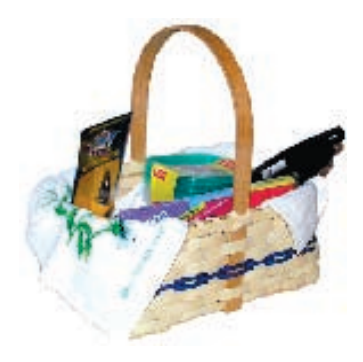
Example of a filled basket Positive Tomorrow's basket.