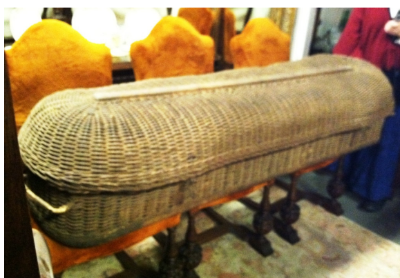
Coffin Basket (rather odd, huh?).