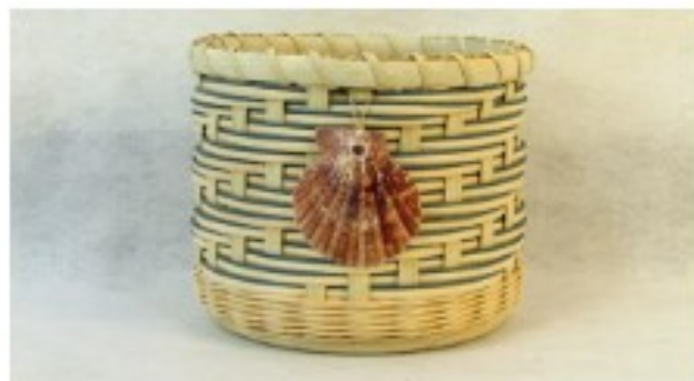
Down By the Sea Color choices available

Make this charming project with a beachy vibe! This basket starts with triple twining and features a continuous twill weave with dyed round reed as an accent. It is woven over a class mold. Tie on a beachy embellishment or leave it off to let the twill shine.