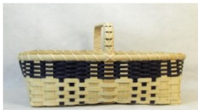
McClintock Color choices available

6 hours Intermediate 7" Diameter x 6" high