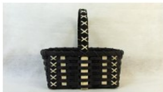
Terina Black and Natural

8 hours Intermediate 19" x 12" x 6" high to Rim 9" high with Handle