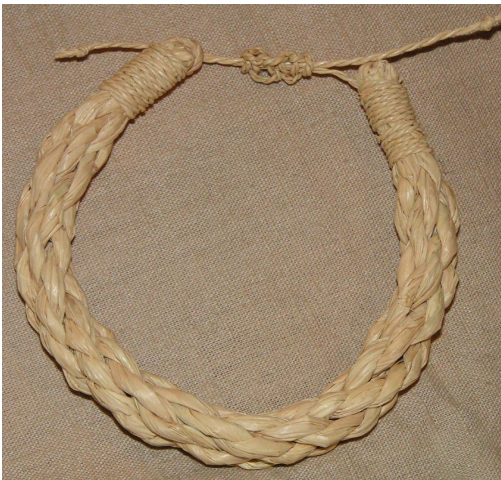
Samples of Helen's work.