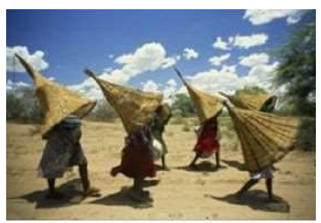
Africa | Mbukushu women return home with woven baskets they use to catch fish. Kalahari Desert, Okavango Delta, Botswana | © National Geographic / Frans Lanting