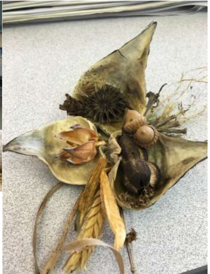
Milkweed pod embellishment