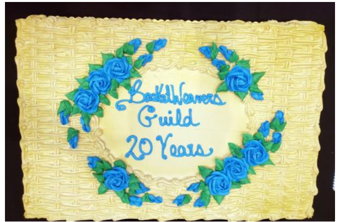
The 20th Anniversary Cake.