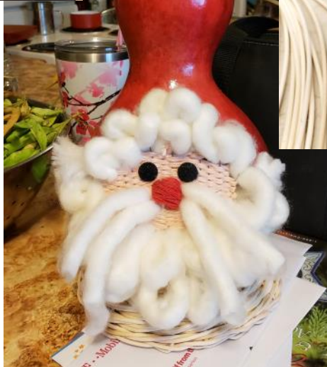
The Screamer Gourds were so Cute and fun to make.