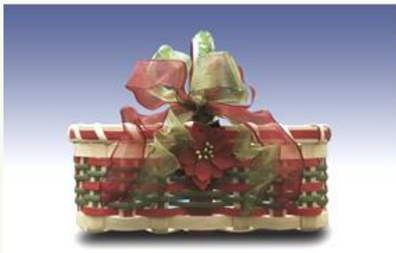
Make a Christmas Basket