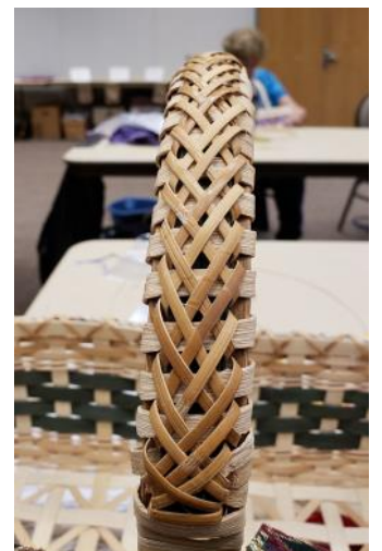
Being able to document details with pictures is a big help.