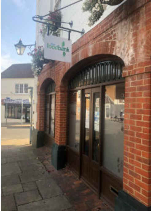
Alton Foodbank (located in the Market Square)

Alton foodbank* is a project founded initially by The Butts Church, and run by local churches, working together towards stopping hunger in Alton and surrounding villages.