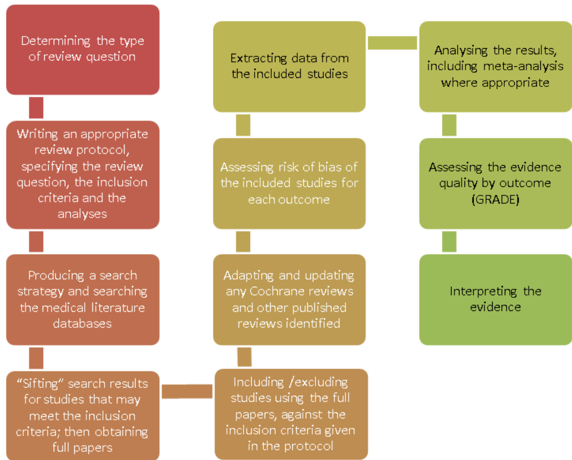
Figure 1: Step-by-step process of review of evidence in the guideline