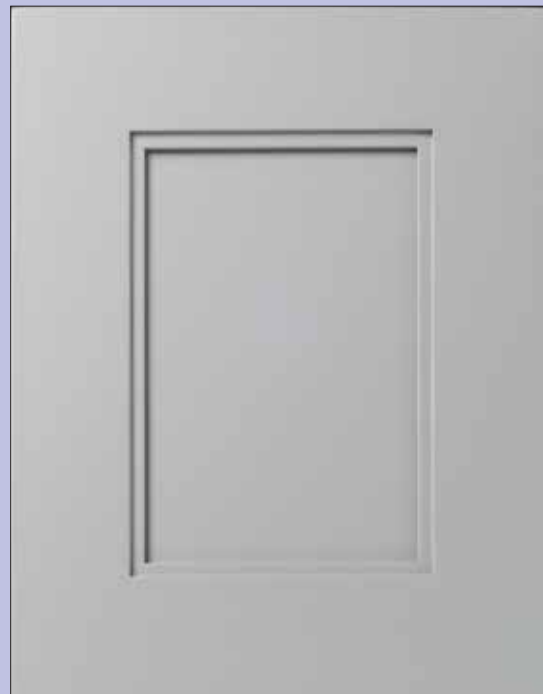
PAINTED HDF FOG GREY