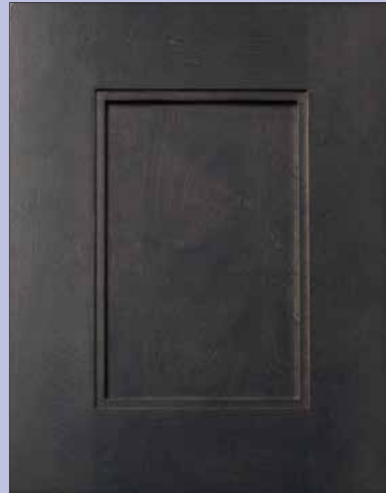
STAINED MAPLE WOOD STEP CHARCOAL GREY