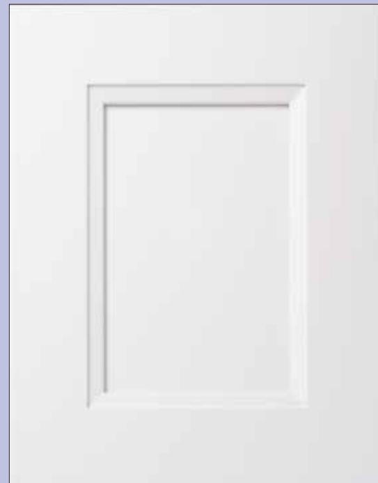
PAINTED HDF BERMUDA WHITE