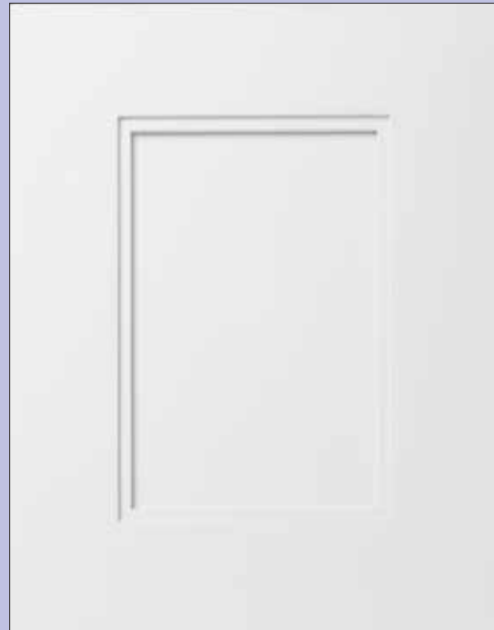
PAINTED HDF STEP SHAKER WHITE