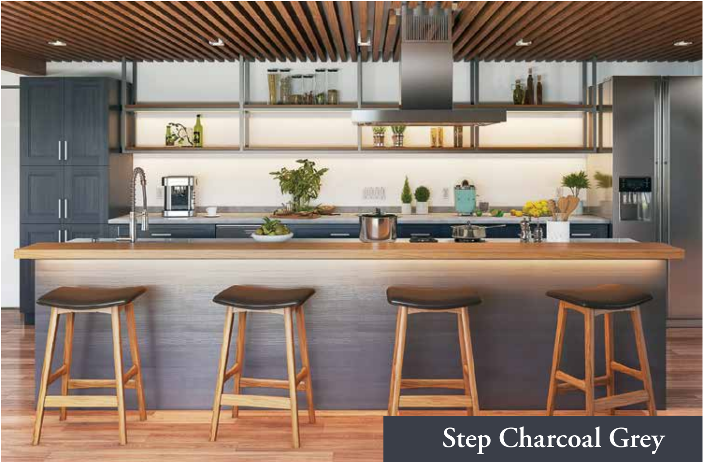
Step Charcoal Grey

Step Charcoal grey doors & drawers feature beautiful solid maplewood in a dark grey stain that shows the natural grain and variations of the wood