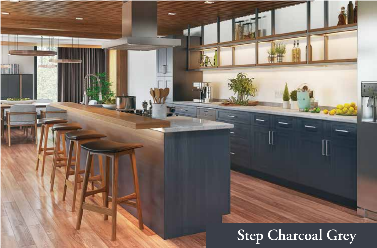
Step Charcoal Grey