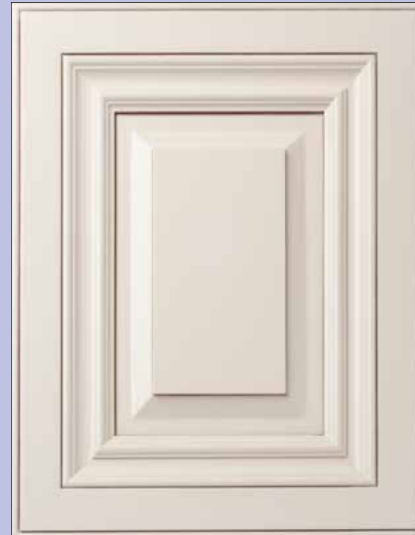
PAINTED MAPLE WOOD ANTIQUE WHITE