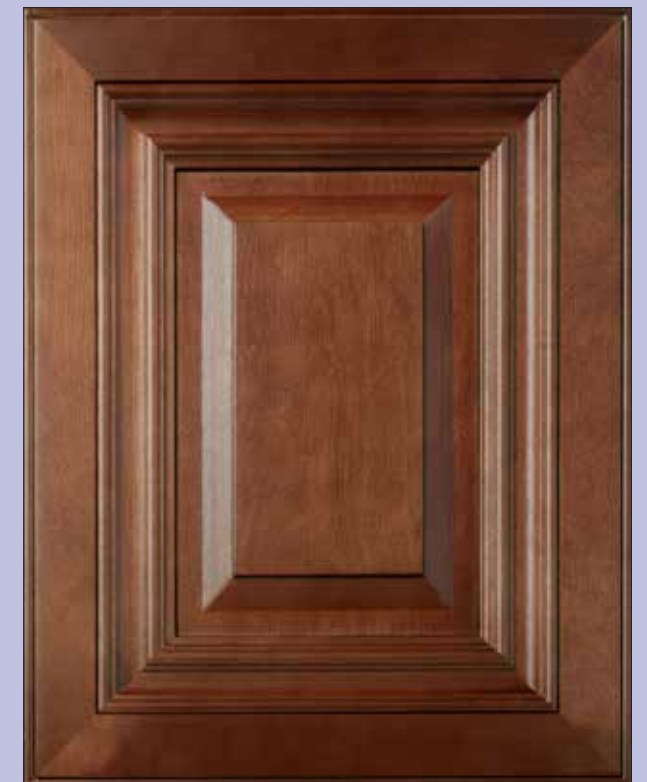
STAINED MAPLE WOOD WALNUT GLAZE