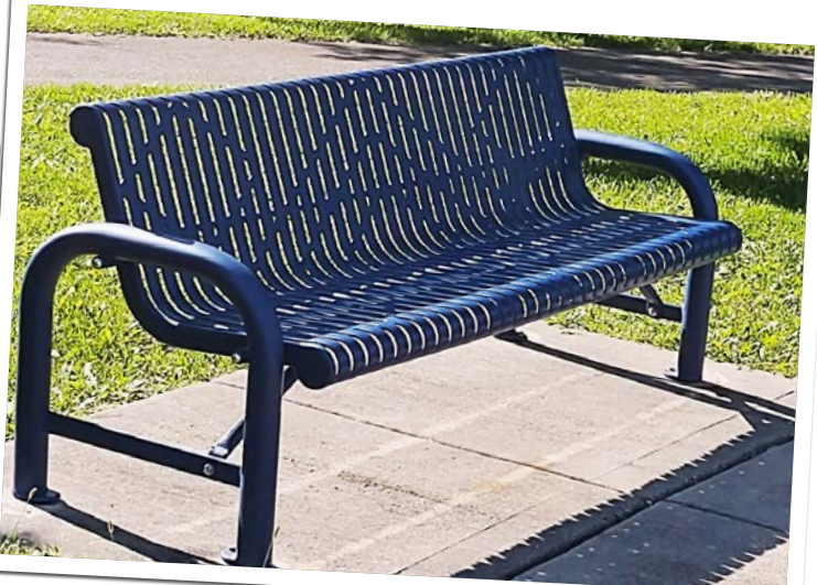
▲ 971-303 Grand Contour 6' bench in laser cut steel