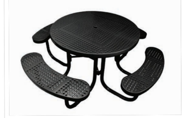
955-1P1 Free standing table with A perforated steel surfaces .