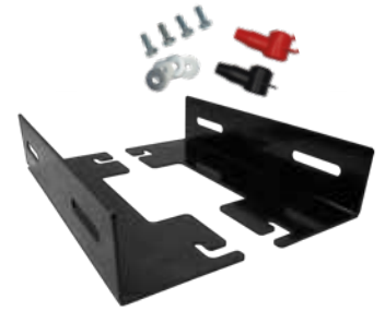
Pair Of Brackets Included

Does NOT include wiring loom. This can be purchased seperately P/N MICROBATLOOM.