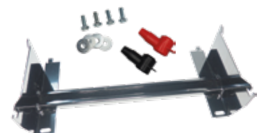
Fitting Bracket Included

Does NOT include wiring loom. This can be purchased separately P/N MICROBATLOOM.