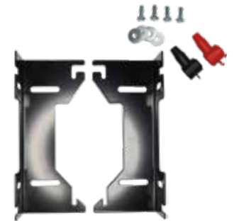
Pair Of Brackets Included

Does NOT include wiring loom. This can be purchased separately P/N MICROBATLOOM.