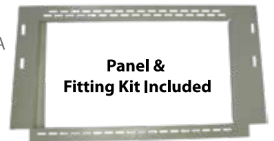
Panel & Fitting Kit Included

Dimensions - Width - 450mm x Height - 260mm x Depth - 415mm