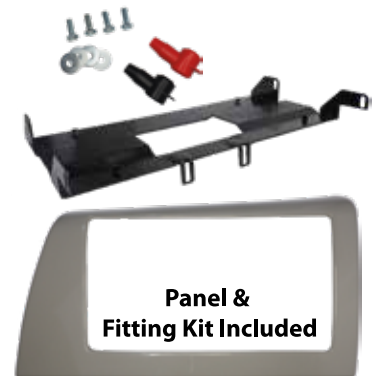
Panel & Fitting Kit Included

Dimensions - Width - 450mm x Height - 260mm x Depth – 415mm