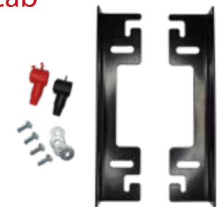
Panel & Fitting Kit Included

Does NOT include wiring loom. This can be purchased seperately P/N MICROBATLOOM.