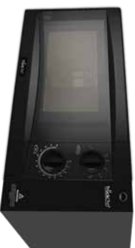
Side Mount Model

Note - As soon as the timer is turned and the unit has power the oven will start cooking. When selecting times less than 2 minutes, turn the dial past 2 minutes and then back to the desired time. The timer should always be returned to the zero position after use. Check food is piping hot and cooked before consuming. The above power levels are only a guide and should in no way be used to alter any food / meal recommended cooking times.