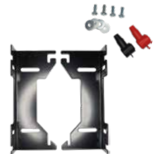
Panel & Fitting Kit Included

Does NOT include wiring loom. This can be purchased separately P/N MICROBATLOOM.