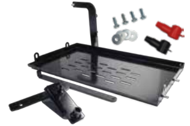
Fitting Bracket Included

Dimensions Width - 530mm x Height - 260mm x Depth – 330mm