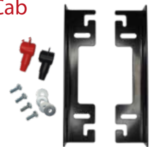
Panel & Fitting Kit Included

Does NOT include wiring loom. This can be purchased seperately P/N MICROBATLOOM.