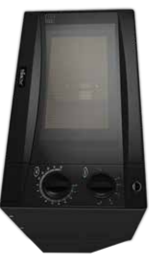
Rear Mount Model