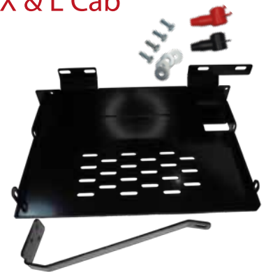
Fitting Bracket Included

Does NOT include wiring loom. This can be purchased seperately P/N MICROBATLOOM.