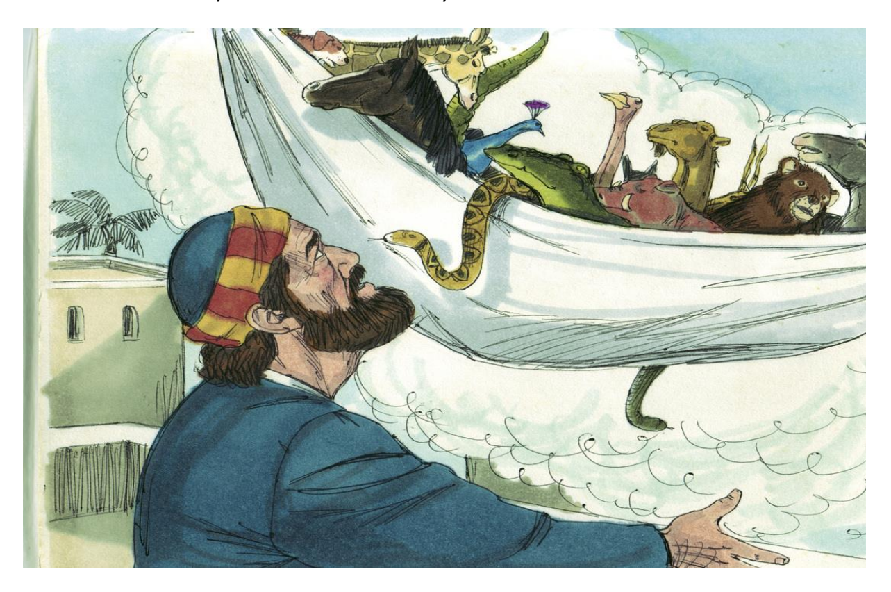
In Acts 11:1-18, 10:28, God SHOWS Peter, and Us too; that God is CALLING and CLEANSING the gentiles; and NOT undoing His Leviticus 11 / Deuteronomy 14 Laws on COMMON or UNCLEAN foods! www.onug.us

Lastly, nowhere in the context is it ever said that God had cleansed unclean meats (this is something that must be assumed by readers who have a predisposition against this statute regulating what we should eat). As Paul says, "The carnal mind is enmity against God; for it is not subject to the Law of God, nor indeed can be" (Romans 8:7). What God has cleansed, by the Blood of Christ, are the Gentiles, NOT unclean foods!!!