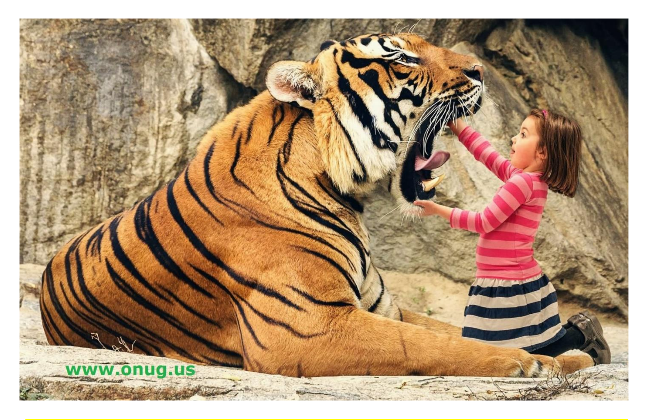
A Return To Paradise When Jesus Returns: www.onug.us

When and Where is Paradise? (Luke 23:39-42 / Matthew 6:7-10 / 1 Thessalonians 4:13-18 / Daniel 12:2-3 / Zechariah 14:4-5 Revelation 5:10, 20:6, 5 / Ezekiel 37:5-6, 12-14)!!!