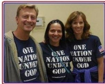
Front of T-Shirt

One Nation Under God Ministries www.onug.us P.O. Box 111960 Naples, Florida 34108 U.S.A. (239) 353-1303