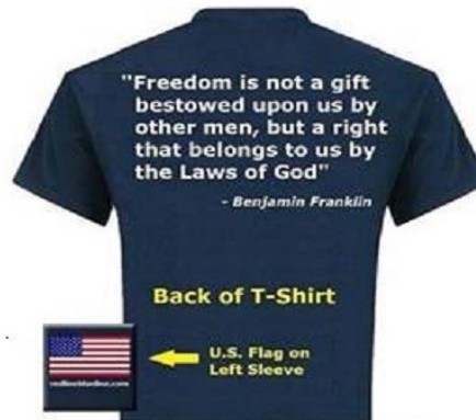
Back of T-Shirt Ben Franklin T-shirt Navy Blue, in Adult Sizes: S, M, L, XL, XXL, XXXL

One Nation Under God Ministries www.onug.us P.O. Box 111960 Naples, Florida 34108 U.S.A. (239) 353-1303