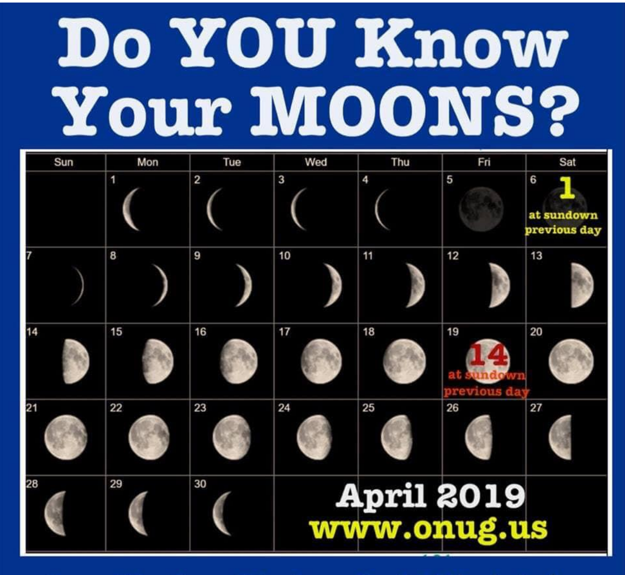
One Nation Under God Ministries

Passover Timing Info : Our Church Headquarters is located in Naples, Florida, USA, and so we observe the moon phases here. On Thursday, April 04, 2019 there was no moon visible in the sky (this is what we call an old moon). Then on Friday, April 05, 2019 there was the first sliver of the new moon visible to the naked eye. The chart above shows the first 29 phases of a 30 day lunar month; the last day is simply a black moon which is not visible to us. Here is what God's Moon looked like, on each night of April 2019 – If YOU went outside, looked up, and 1 Thessalonians 5:21!!! www.onug.us