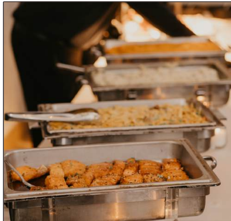
Buffet Options for Any Booking

Our buffet service offers a convenient and delicious dining experience, with setup and maintenance included for any event style.