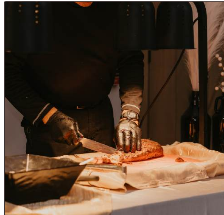
Upgraded Options for Full-Service Bookings

Enhance your full-service event with plated meals, elegant cocktail hours, or interactive food stations. Our team delivers a seamless dining experience tailored to your vision!