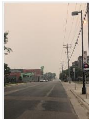
Wildfire smoke in Minneapolis, MN