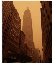
The Empire State Building as seen from the ground on June 7, 2023