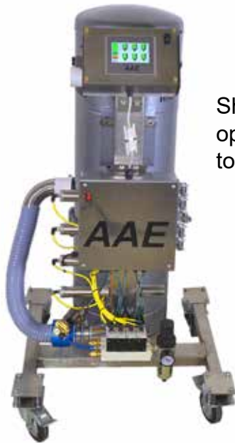
Shown with optional color touch display.

Multiple station systems per-wired and ready to run.